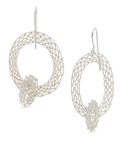
YU FANG CHI .999 Silver filigree $300

Cognac and champagne diamonds, 18ct gold, smoky quartz $4835